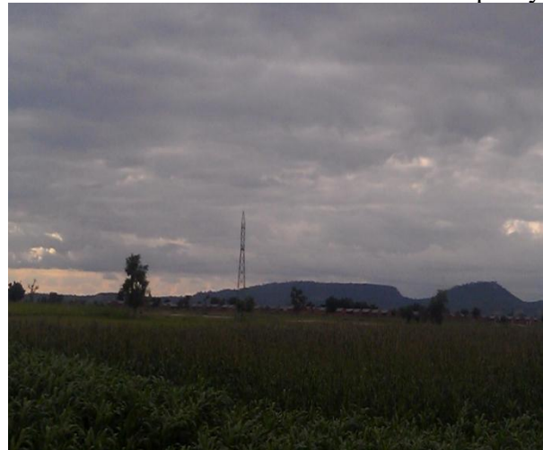
Plate 2 Resettlement housing at Ashaka area