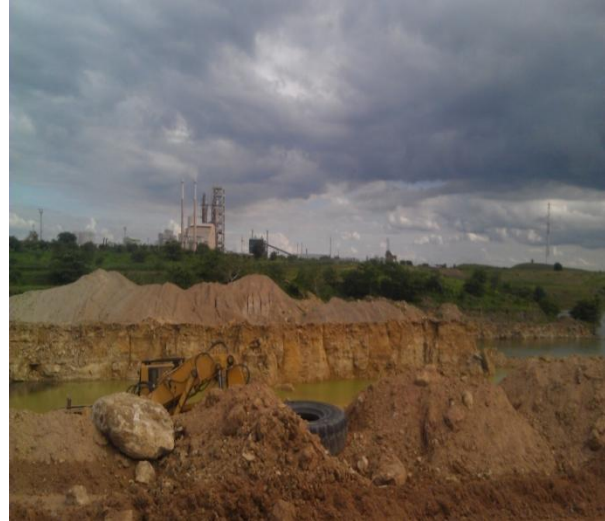
Plate 1 Reclamation efforts made at the quarry

Based on the findings presented in table 8, the results shows that majority of the respondents constituting 47% admitted loss of farm lands is the major problem associated with limestone mining. This is accompanied by discharge of pollution as the second problem associated with the activity as reported by 27% of the respondents, Then followed by spread of erosion which is 20%. Even though the least problem associated with the mining activity as reported was destruction of landscape it has disfigured the configuration of the Ashaka land area making it different for farming activities.